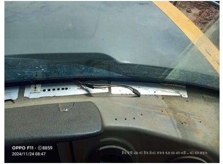
OPPO F11 - ©8859 2024/11/24 08:47