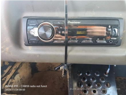
OPPO F11 - ©8859 radio not funct 2024/11/24 08:50