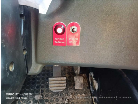
OPPO F11 - ©8859 2024/11/24 08:47