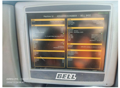
OPPO F11 - 2024/11/24 08:47