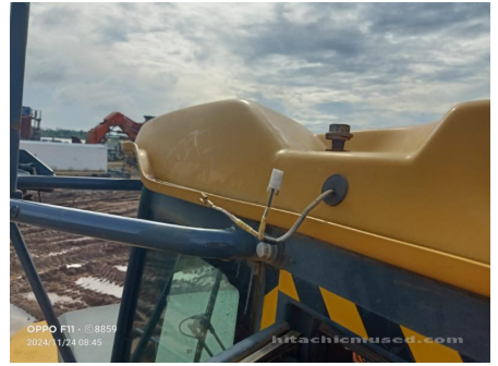
OPPO F11 - 2024/11/24 08:45