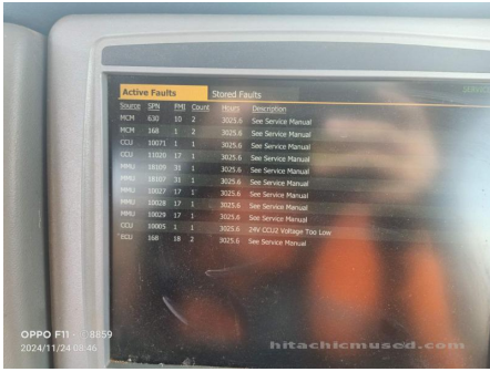
OPPO F11 - ©8859 2024/11/24 08:46