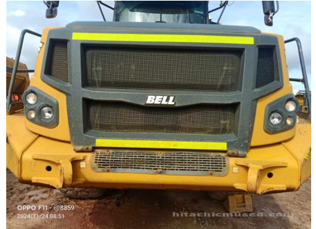
OPPO F11 - ©8859 2024/11/24 08:51