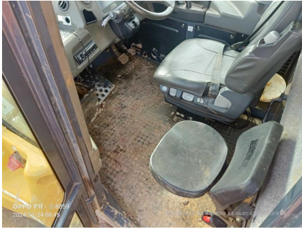
OPPO F11 - 2024/11/24 08:45