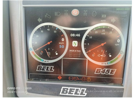
OPPO F11 - ©8859 2024/11/24 08:46