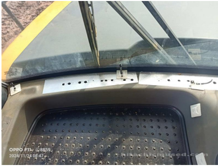
OPPO F11 - ©8859 2024/11/24 08:47