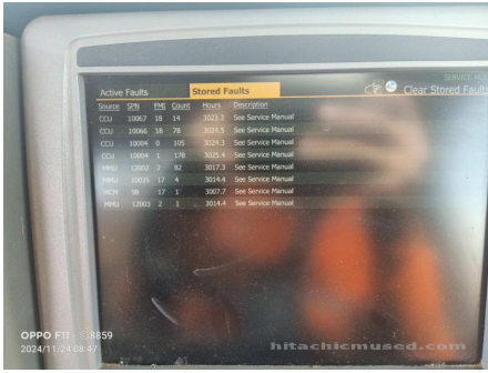
OPPO F11 - ©8859 2024/11/24 08:47