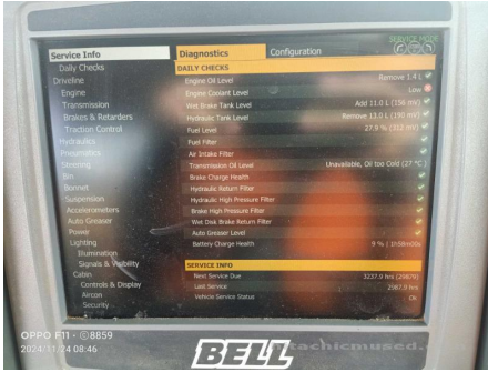
OPPO F11 - 2024/11/24 08:46