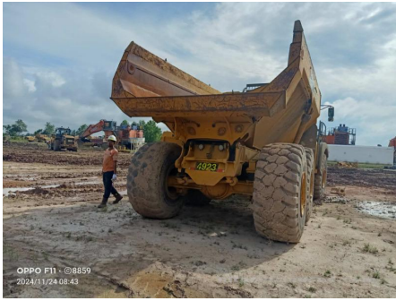
OPPO F11 - ©8859 2024/11/24 08:43