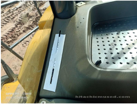
OPPO F11 - ©8859 2024/11/24 08:47