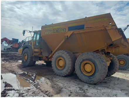
OPPO F11 - ©8859 2024/11/24 08:44